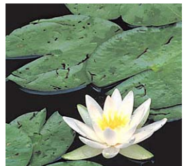
White Water Lily